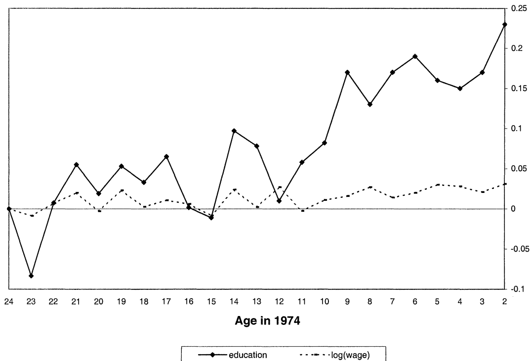
FIGURE 3. COEFFICIENTS OF THE INTERACTIONS AGE IN 1974* PROGRAM INTENSITY IN THE REGION OF BIRTH IN THE WAGE AND EDUCATION EQUATIONS

with valid wage data. Thus, on average, the program caused a 3 to 7 percent increase in the wages of this cohort.