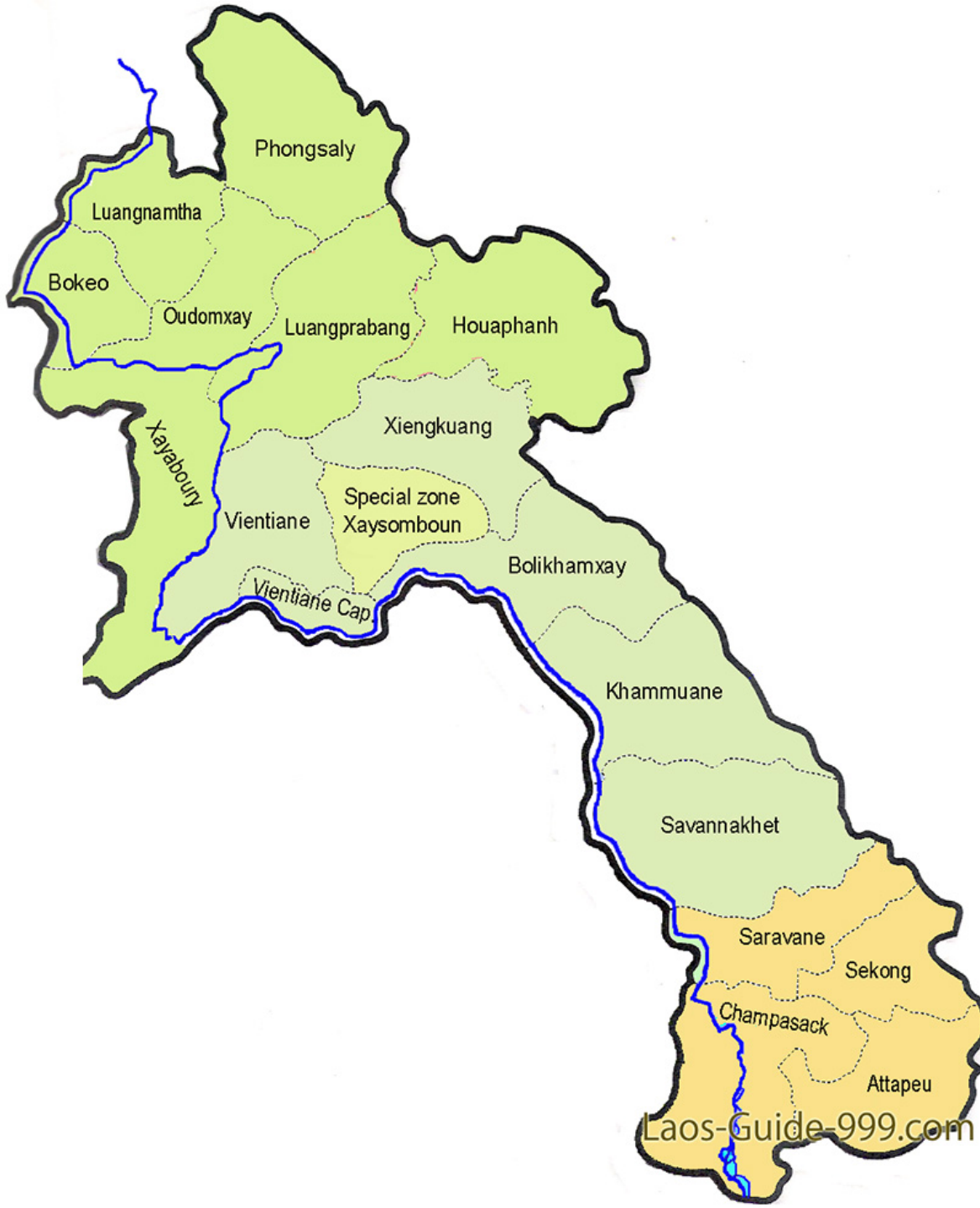
The map of Lao PDR