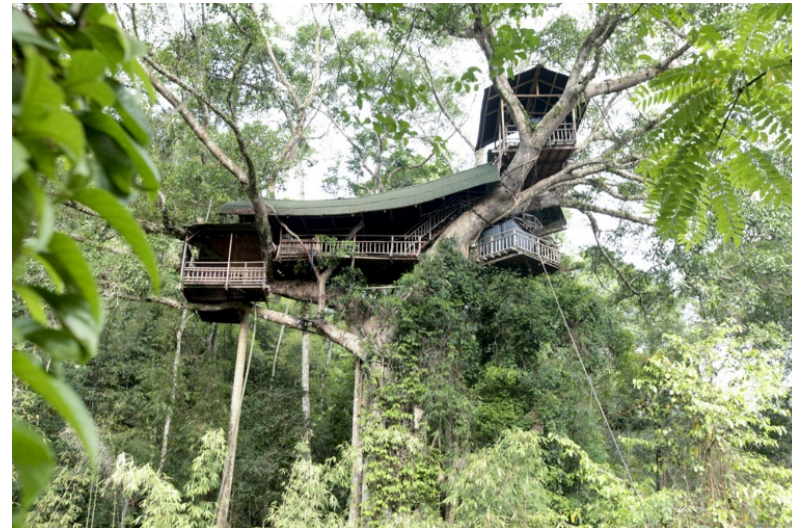
Zipline business in the Lao PDR