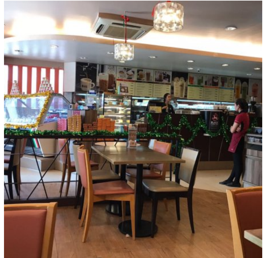
Black Canyon in Vientiane