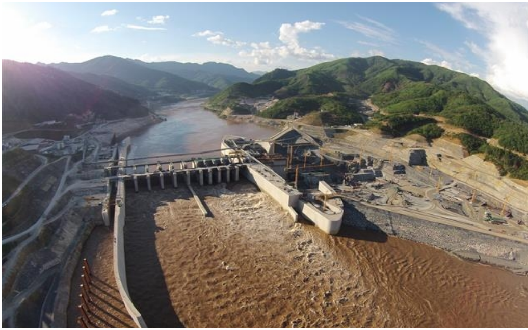
Xyaburi Hydropower Project in the Lao PDR

(Thai SOEs and private sector 80%, the Lao PDR government 20%)