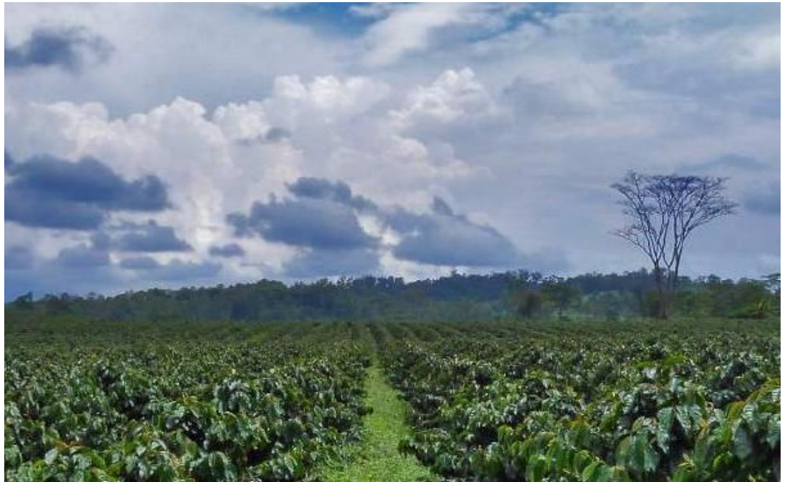
Coffee plantation in the Lao PDR

(Thai SOEs and private sector 80%, the Lao PDR government 20%)