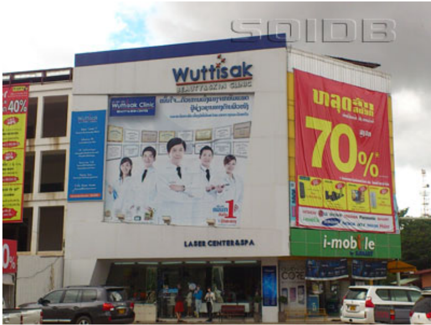
Wuttisak Clinic in Vientiane