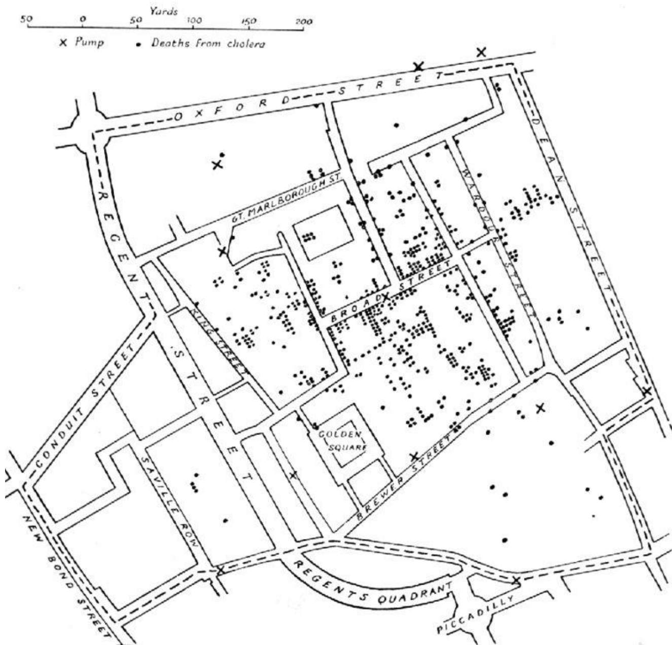
Original map by John Snow showing the clusters of cholera cases in the London epidemic of 1854 , drawn and lithographed by Charles Cheffins.