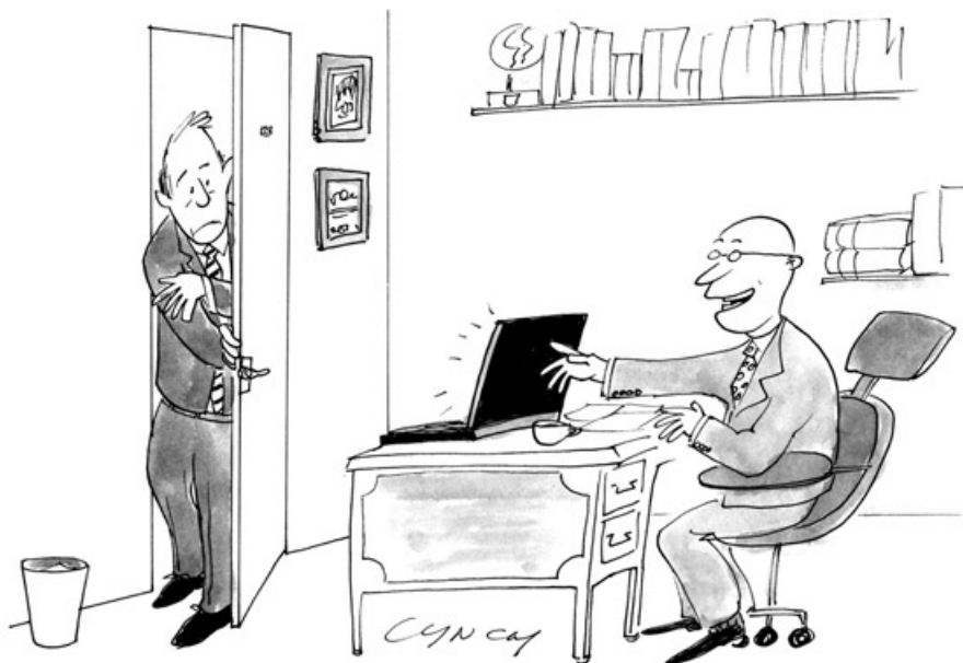
"Come in, Thompson. But before you get any time with me, you'll have to watch a short advertisement."