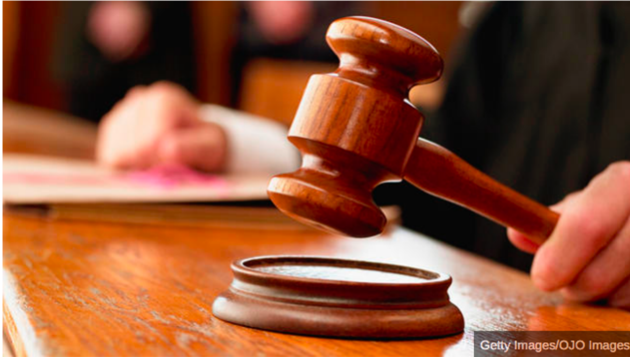
Close up of judge raising gavel in courtroom

A tax protester locked up in federal prison in Fort Worth arranged to pay $100,000 to kill the judge presiding over his case, but the "hit man" he hired was an undercover FBI agent, according to a criminal complaint .