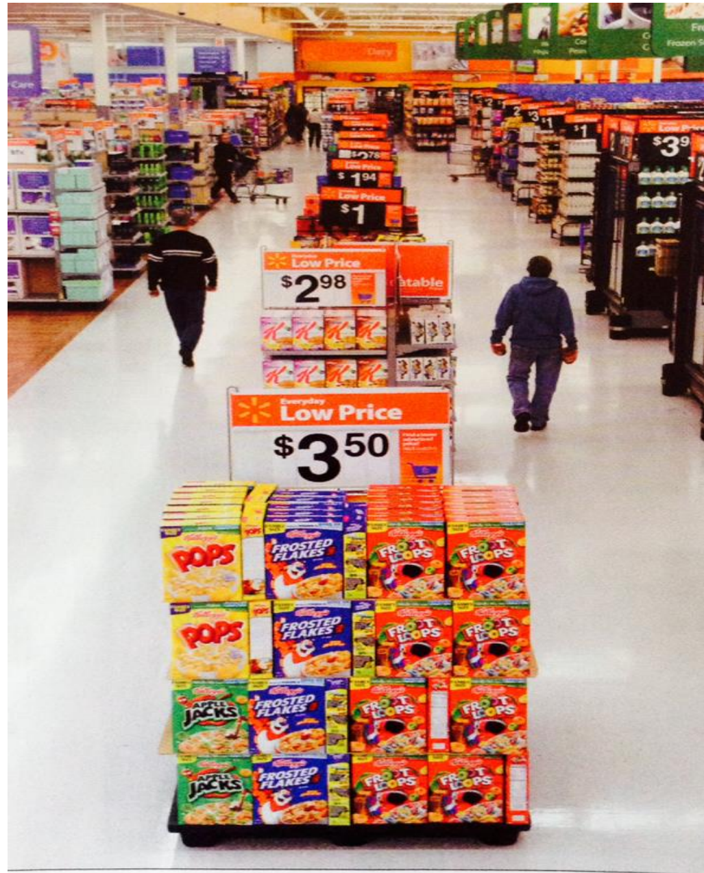
Supercenters offer a vast assortments under one roof.