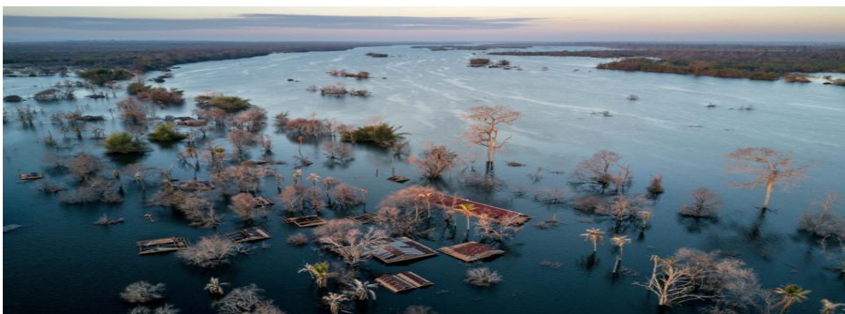
The former village of Srekor in northeastern Cambodia, among several that were submerged after the completion of the Lower Sesan 2 hydroelectric dam in 2018.

The human and environmental costs of BRI projects have been similarly high in other parts of Asia and in Africa. The Chinese government may be providing badly needed loans for infrastructure development, but it is also setting the stage for widespread abuses to occur by failing to ensure that the companies involved acknowledge the findings of environmental and social impact assessments and adequately compensate affected communities.