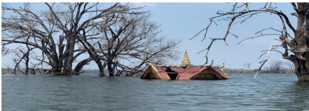
Former shrine in the village of Srekor, northeastern Cambodia, inundated after the completion of the Lower Sesan 2 hydroelectric dam.

We started doing interviews on the ground in early 2019, when the effects of the dam had become evident. Since then and due to the Covid-19 pandemic, we have been following up with regular telephone calls.