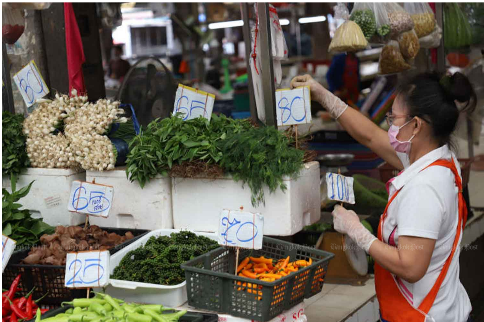
A vegetable vendor arranges price tags at the Bang Kapi wet market in Bang Kapi district, Bangkok, on Tuesday.

Thailand's headline consumer price index (CPI) in April rose 4.65% from a year earlier, driven by higher energy and food prices, the Commerce Ministry said on Thursday, though the figure came in below forecasts.