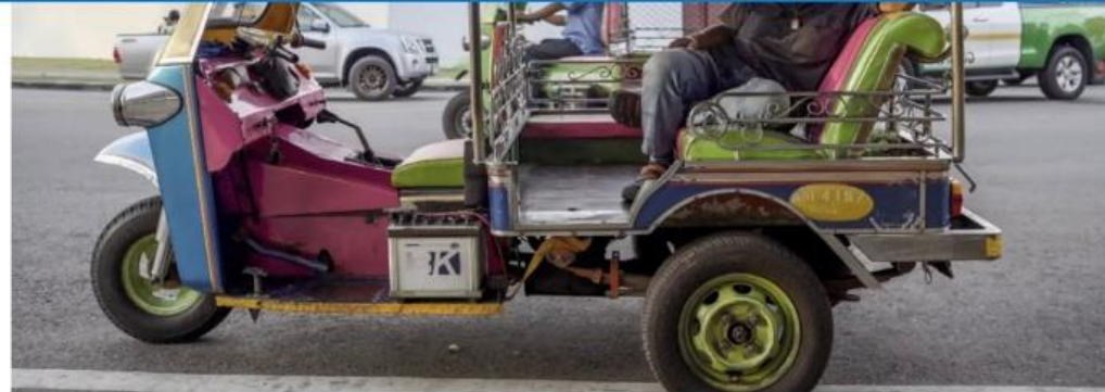
Business has stalled for Thailand's famous tuk-tuks.