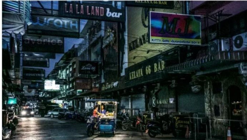
With hundreds of bars shut, Pattaya has changed from party town to ghost town.

Rodjana returned to her hometown of Suphanburi, 100 kilometers northwest of Bangkok. She now runs an organic vegetable farm, which has sales of around 6,000 to 9,000 baht ($180 to $270) per month -- a fraction of the 40,000 baht the T-shirt shop generated.