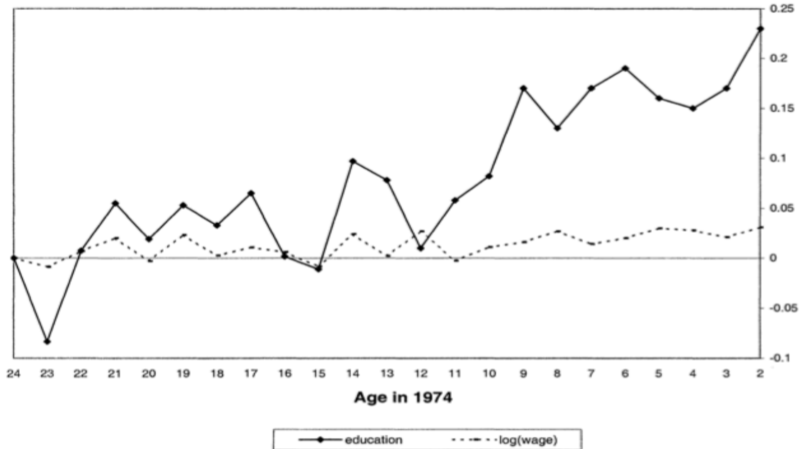
FIGURE 3. COEFFICIENTS OF THE INTERACTIONS AGE IN 1974* PROGRAM INTENSITY IN THE REGION OF BIRTH IN THE WAGE AND EDUCATION EQUATIONS