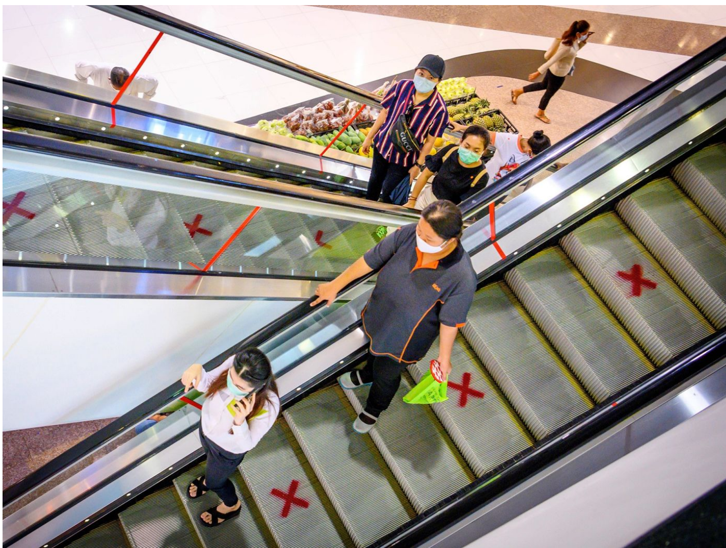
People ride escalators marked for social distancing in a shopping mall in Bangkok.