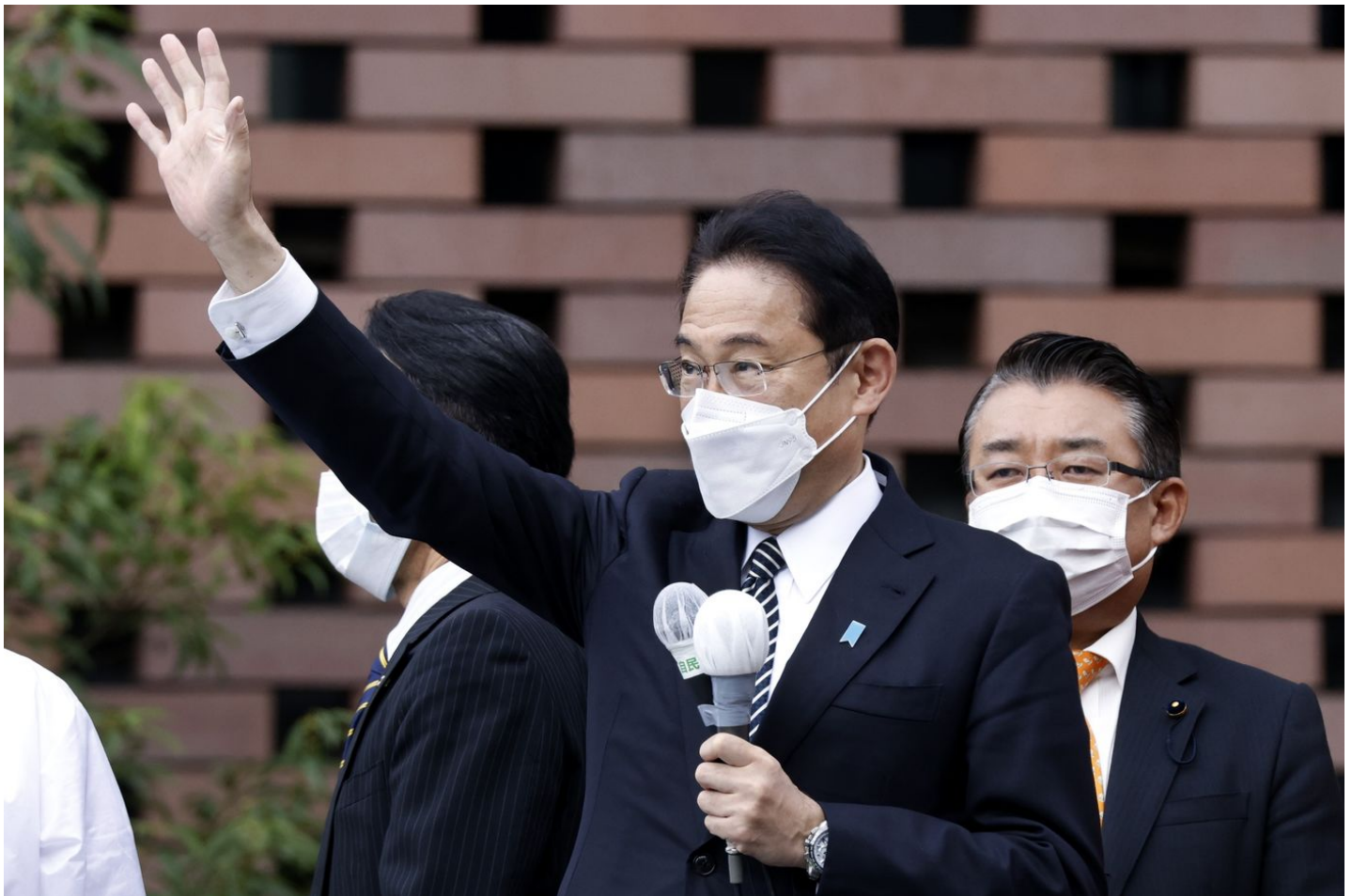
Fumio Kishida during an election campaign event in Tsukuba, Ibaraki Prefecture, on Oct. 26.

Japanese Prime Minister Fumio Kishida, who faces an election in three days, wants to retain easy central bank policy while the main opposition party would consider a gradual change in monetary direction.