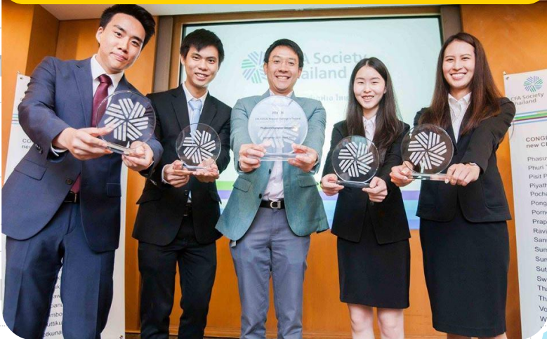
2015-16 Local Champion