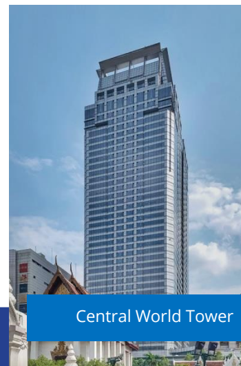
Central World Tower