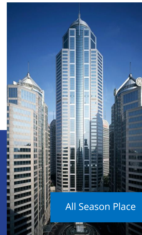
All Season Place