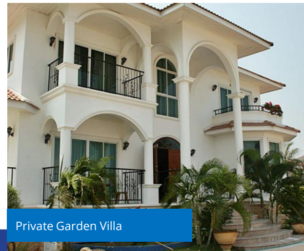
Private Garden Villa