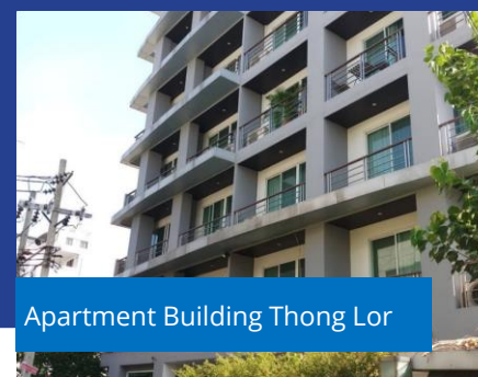
Apartment Building Thong Lor