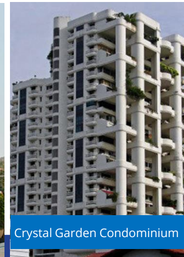
Crystal Garden Condominium