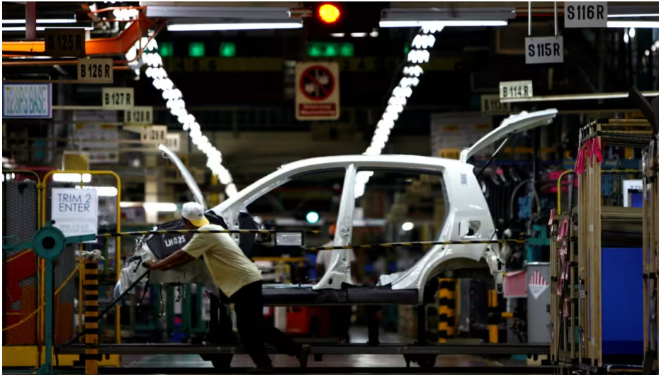
Perodua, backed by conglomerate UMW Holdings, is Malaysia's top automaker.

Sime Darby purchase of UMW unites brands from Toyota to Perodua under its banner