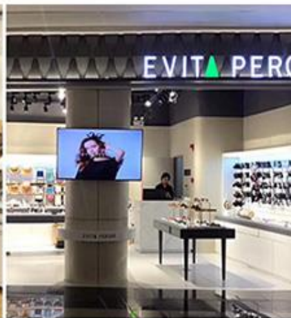
CHINA · FUZHOU