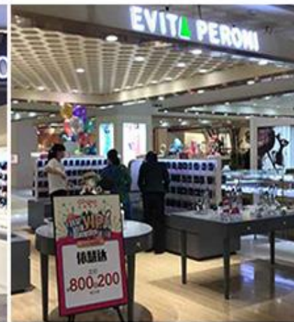
CHINA · KUNMING