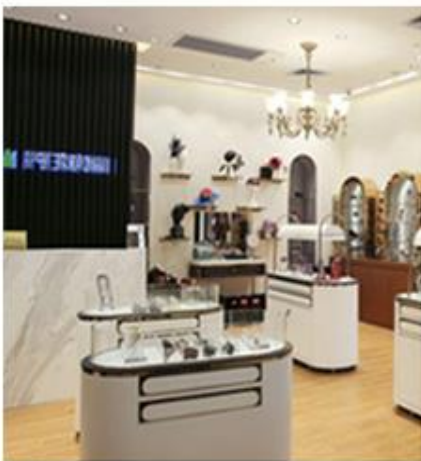
CHINA · GUANGZHOU