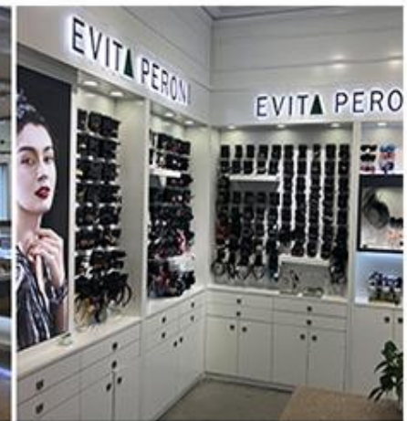
CHINA · HANGZHOU