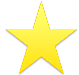
Exhibit 1.3 The International Marketing Task