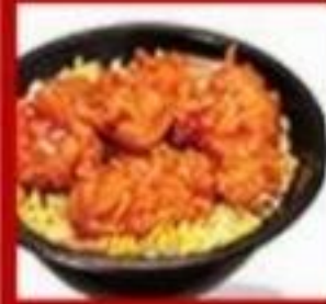
Wings n Rice