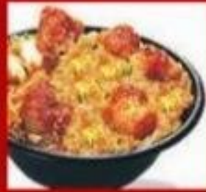
Rice n Spice