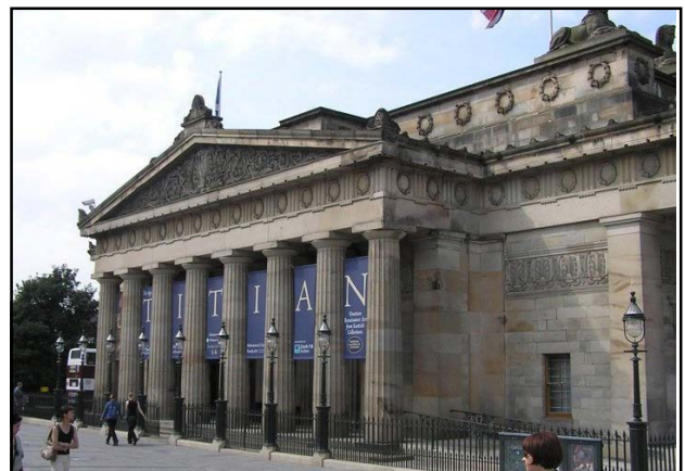
Royal Scottish Academy, Edinburgh, Scotland (1826)

It is a style principally derived from the architecture of Classical Greece and Rome.