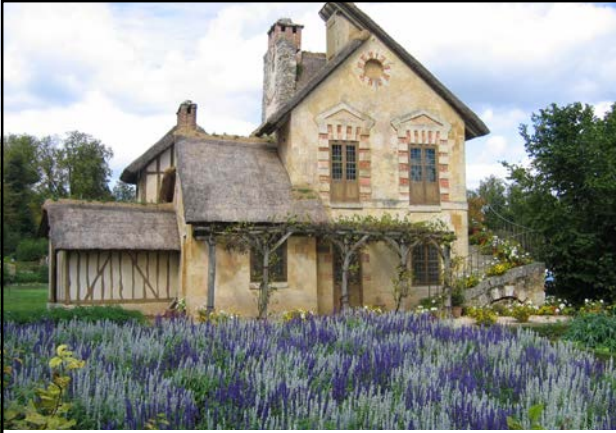
Hameau de la Reine , The Queen's hamlet, 1783