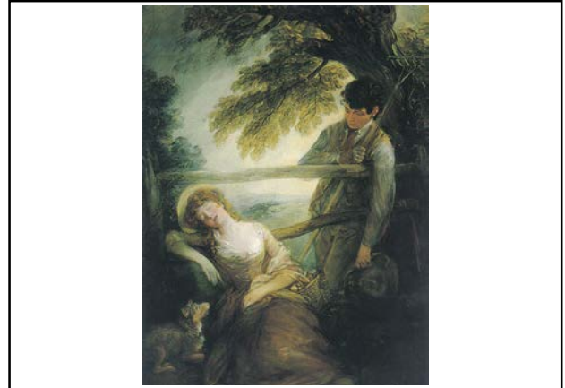
Thomas Gainsborough, Haymaker and Sleeping Girl , c. 1785