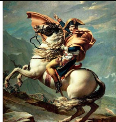
David, Napoleon Crossing through the St. Bernard Pass , 1801