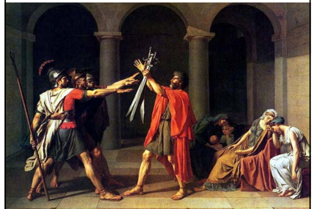
Oath of the Horatii , David, 1784.

David was the most famous Neoclassical painter. He incorporated revolutionary themes of republicanism and personal sacrifice into his art.